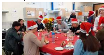
LCA Staff Christmas Dinner