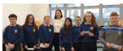
Junior Debating Team