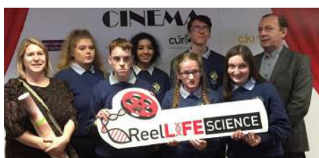
LCAs Win Silver in ReelLife Science Competition