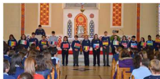
Opening of School Year