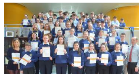
Junior Profile of Achievement Certificate Presentation