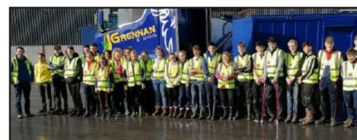
L Cert Ag Science Class visit Grennan's Rath