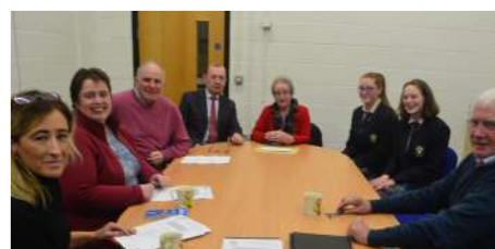
Members of the Student Council addressing the Board of Management