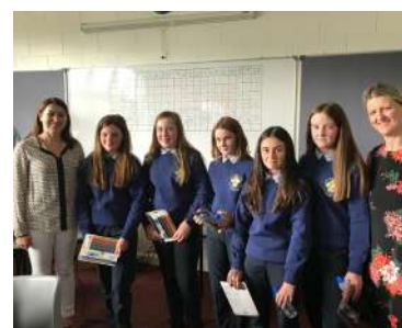
Cairde Quiz Winners