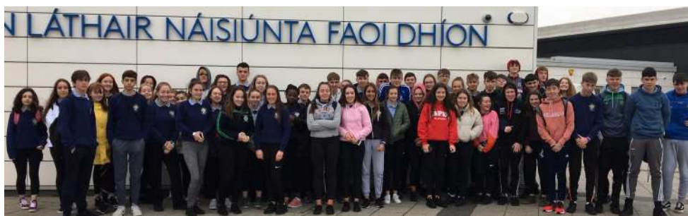
Tys at Zeminar