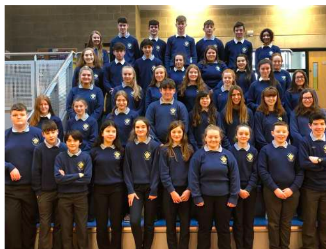
Class Prefects 2019 - 2020