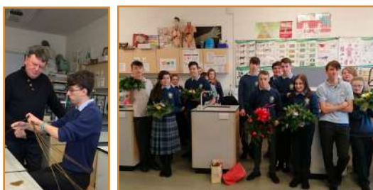
LCA Basket Weaving & Wreath Making