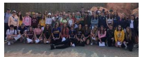
Trip to Italy