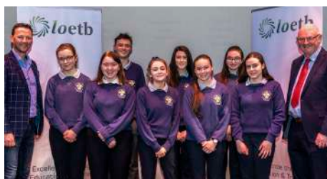
LOETB Artistic Talents Performance Awards