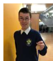
Dale Coyne Gold Medal in 25m front crawl in the Leinster Swimming Final