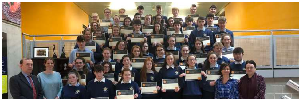
MOS Cert Presentation