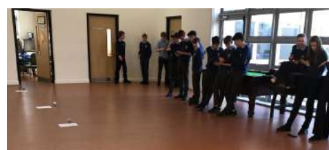
2nd Year Maths Class