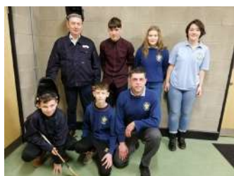
Talent Show Winners