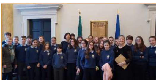
Class 2B on CSPE Trip to Leinster House