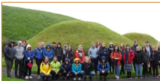
Art Trip to Newgrange & Knowth