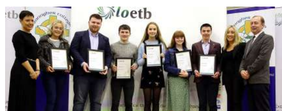
LOETB Leaving Cert 2, LCA2 & Junior Cert Awards