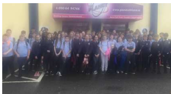
First Year Cairde Trip