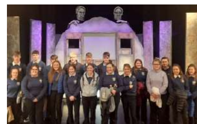
Leaving Certs attended An Trail in Limerick