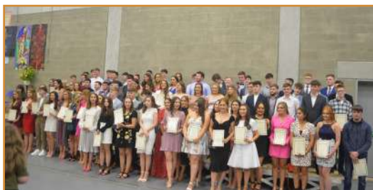
Leaving Cert Graduation 2019