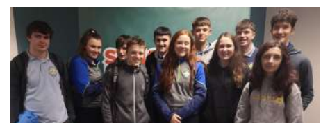
School Digital Champions