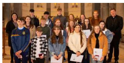
John Paul 2 Awards